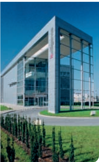
The itelligence-data center in Poznan, Poland.

The demands on your SAP systems are high. You can only achieve guaranteed availability, high flexibility and protection from intruders by building up and maintaining a corresponding infrastructure and with a great deal of know-how. This continually ties up personnel and material resources, which are then no longer available to take care of your company's actual business processes. Why are you still operating your SAP landscape yourself?